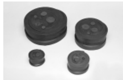
Spiral End Seals